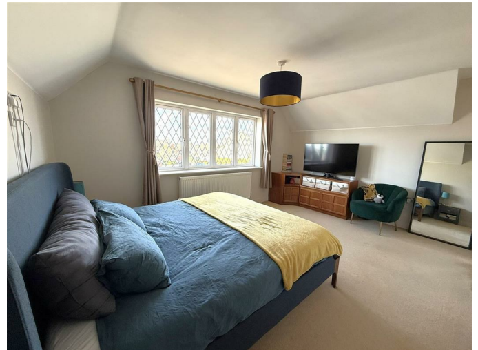
Master Bedroom 17'07" x 15'0" Maximum (5.36 x 4.57 Maximum)

Double glazed window to the front, two radiators, fitted wardrobes, door in to the en suite and archway in to the dressing area.